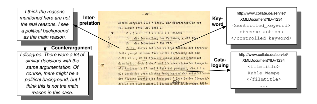
Fig. 2. Annotation thread, keywords, cataloguing